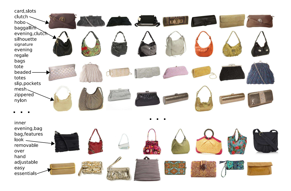
Fig. 4. Automatically discovered handbag attributes, sorted by visualness.

appearance characteristic of the object or a more localized appearance characteristic? We also provide a way to identify attribute type (Section 3.2) – ie is the attribute indicated by a characteristic shape, color, or texture?