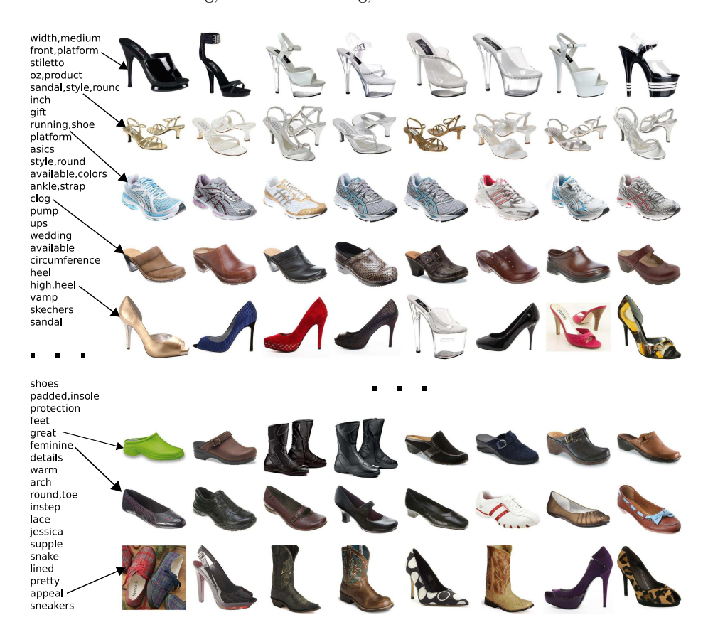
Fig. 5. Automatically discovered shoe attributes, sorted by visualness.

If i indexes images, and j indexes segments and the boosted classifier predicts the score of a sample as a linear combination of weak classifiers: y_{ij} = \sum_t \lambda_t c^t(x_{ij}) . Then the probability that segment j in images i is a positive example is