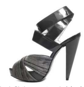
Rock and roll in these sexy, strappy heels from Report Signature. The smoldering Rockwell features a grey patent leather upper with pleated satin crossing at the open-toe atop a 1 inch platform, patent straps closing around the ankle with a gold buckled, and finally a 5 inch patent cone heel. Sizzle in these fierce mile-high shoes.