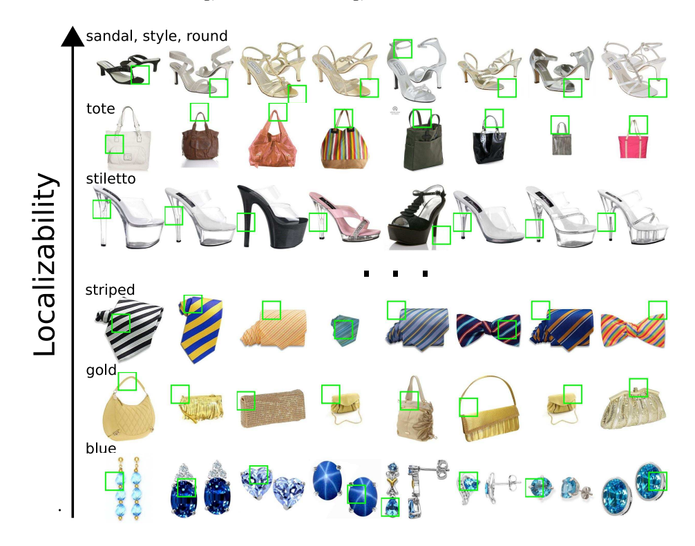
Fig. 6. Attributes sorted by localizability. Green boxes show most probable region for an attribute.

have 37795 images: 9145 images of handbags, 14765 images of shoes, 9235 images of earrings, and 4650 images of ties. Though these images were collected from a single website aggregator, they originate from a variety of over 150 web sources (e.g., shoemall, zappos, shopbop), giving us a broad sampling of various categories for each object type both visually and textually (e.g., the shoe images depict categories from flats, to heels, to clogs, to boots). These images tend to be relatively clean, allowing us to focus on the attribute discovery goal at hand without confounding visual challenges like clutter, occlusion etc.