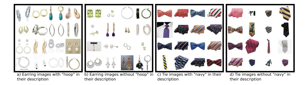
Fig. 3. Example input images for 2 potential attribute phrases ("hoops", and "navy"). On the left of each pair (a,c) we show randomly sampled images that have the attribute word in their description. On the right of each pair (b,d) we show randomly sampled images that do not have the attribute word in their description. Note that these labels are very noisy – images that show "hoops" may not contain the phrase in their description, images described as "navy" may not depict navy ties.

with data for particular categories, rank attributes by visualness, and then go into a more detailed learning process to identify the appropriate feature type and localizability of attributes using the multiple instance learning and boosting (MILboost) framework introduced by Viola [23].